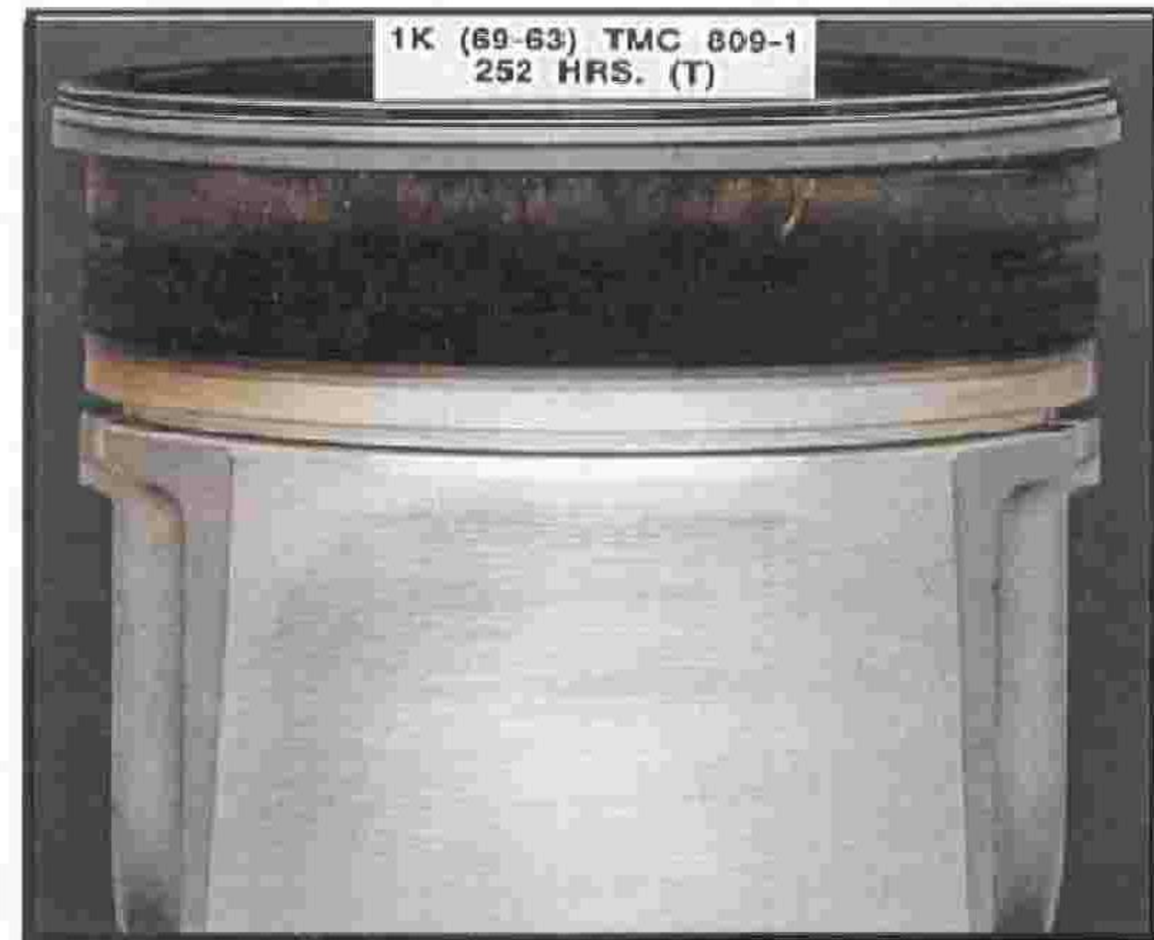
1-K CATERPILLAR TEST PISTON (Outer Surface of Piston)

This is the Piston that was treated with ACES.